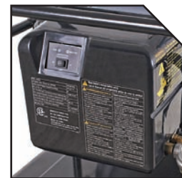
On/Off High/Low settings