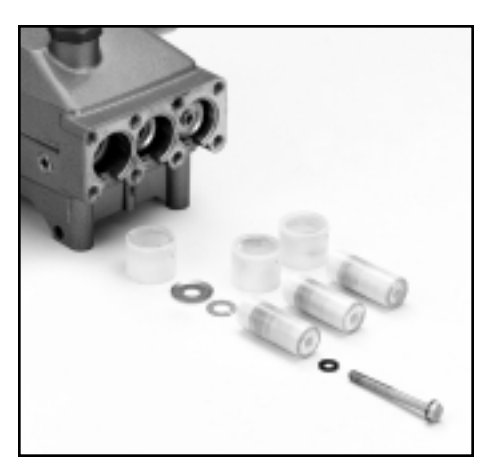
All Models Plunger Arrangement