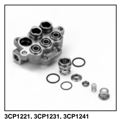
Discharge Valve Assembly