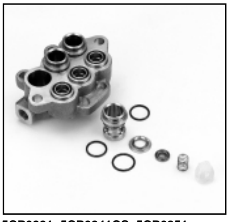
5CP6221, 5CP6241CS, 5CP6251