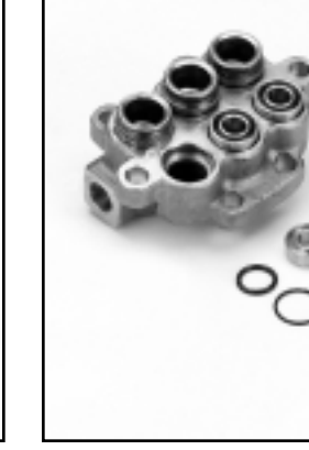
3CP1221, 3CP1231, 3CP1241 Inlet Valve Assembly