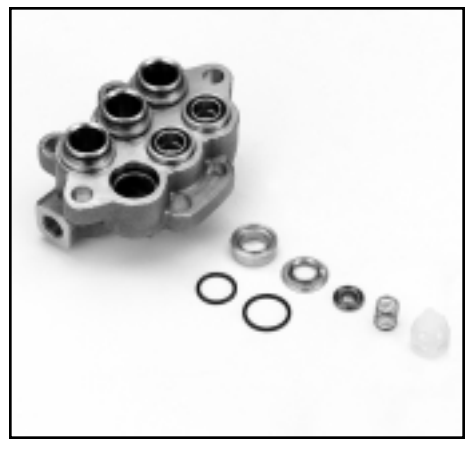
5CP6221, 5CP6241CS, 5CP6251 Inlet Valve Assembly