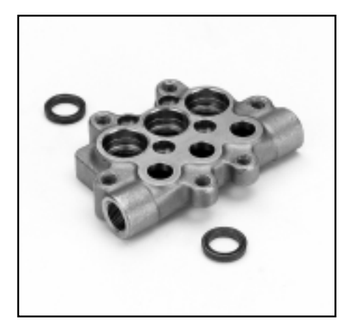
All Models Seal Arrangement