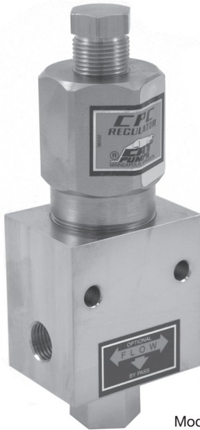
Model 7710 Shown