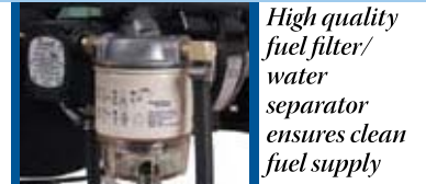
High quality fuel filter/water separator ensures clean fuel supply