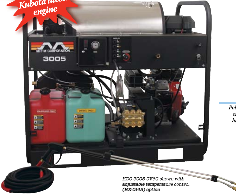
HDC-3005-OV6G shown with adjustable temperature control (HX-0145) option